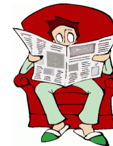
Table Talk/Tygerburger/Easi Ads